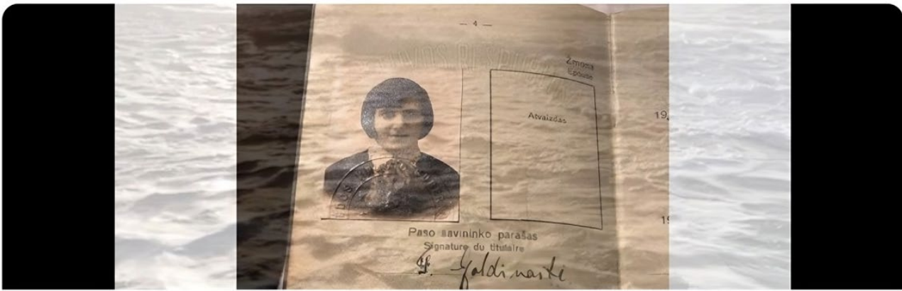
Figure 5. Jewish refugee voyages to the South. Screenshot from Oceanic Swimming | writing | thinking for justice-to-come scholarship.