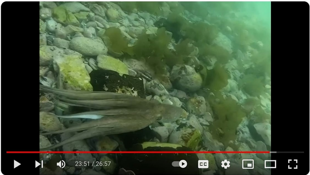
Figure 3. Octopus pursuing cormorant. Screenshot from Oceanic Swimming | writing | thinking for justice-to-come scholarship.