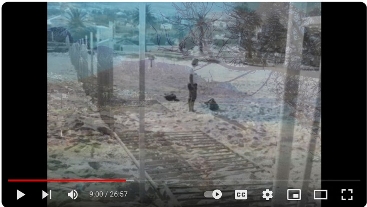
Figure 4. Camps Bay beach with apartheid fence. Screenshot from Oceanic Swimming | writing | thinking for justice-to-come scholarship.

circling them like sharks. Whether it is just a mild irritation or when the humans come too close whether they are seen as a threat, Here am I trying to interpret or anthropomorphise the feelings of the octopus just after castigating that type of behaviour. But we humans are full of contradictions swaying this way and that, justifying our moves along the way.