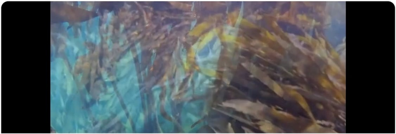
Figure 1. 5 African kelp sea forest. Screenshot from Oceanic Swimming | writing | thinking for justice-to-come scholarship .

an intimate encounter, where we feel our shared vitalities and entanglements as poignantly as the kelp that winds around us and that offers a moment of stability in wild seas.