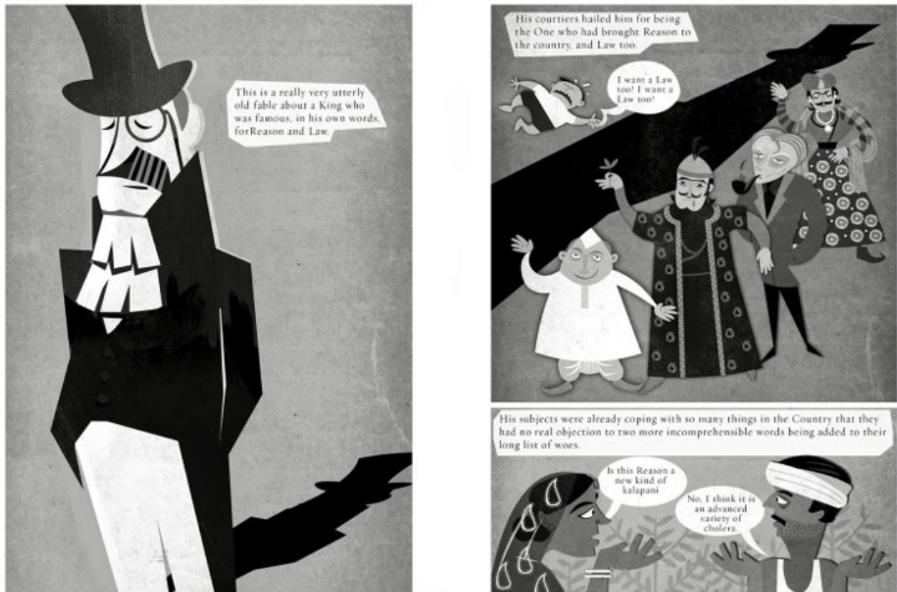
Figure 2. This side, that side . Tabish Khair and V. Ghosh (ed). 2013. © Priya Kuriyan.