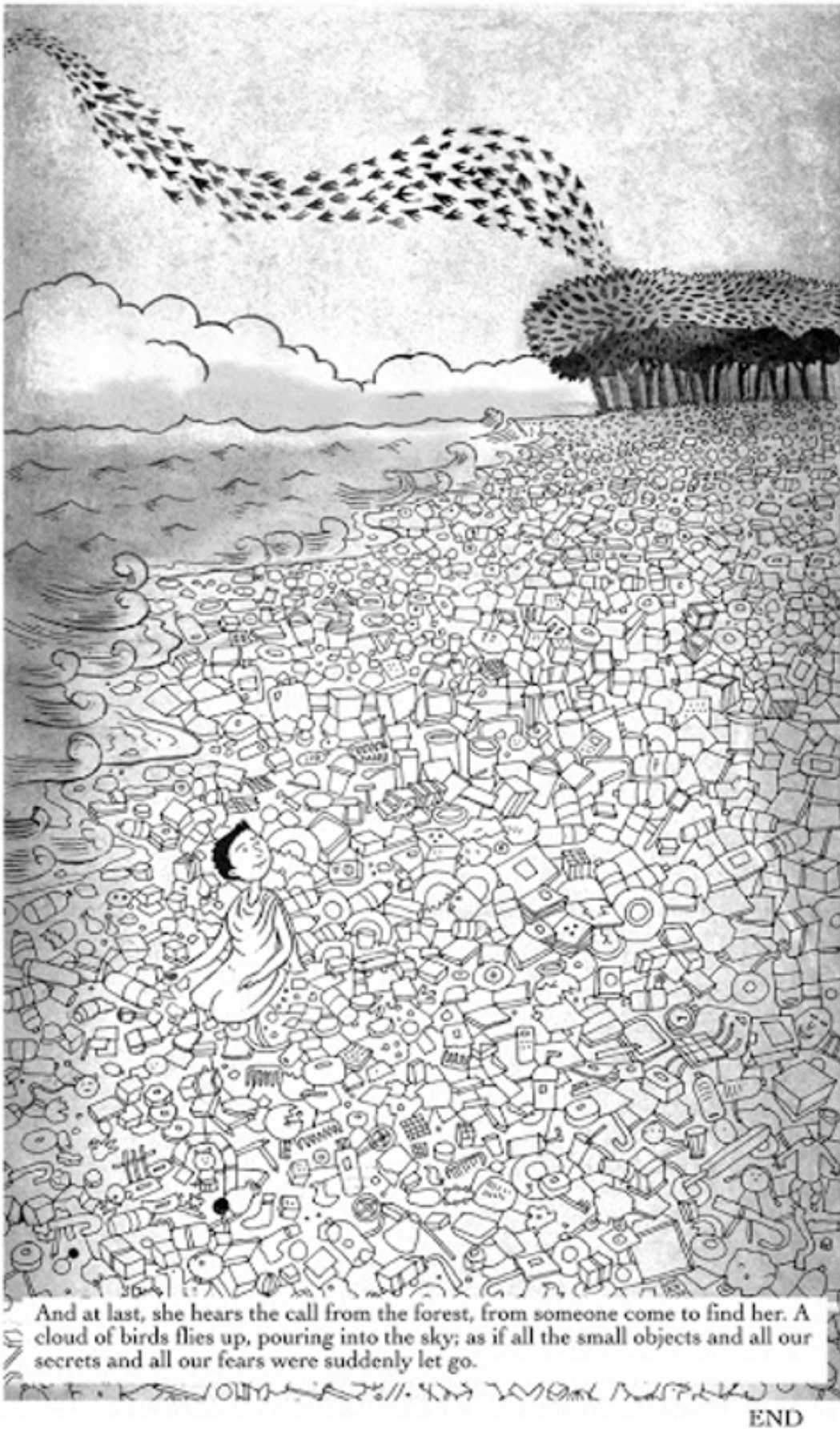
Figure 3. 'Swallow the moon' from Eat the Sky, Drink the Ocean . Kate Constable and Priya Kuriyan. 2015. © Priya Kuriyan.