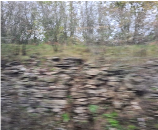
Figure 2. 'Layers of nostalgia'.

10 years now that I live in Montreal. I feel more and more at home. I make it more and more at home.